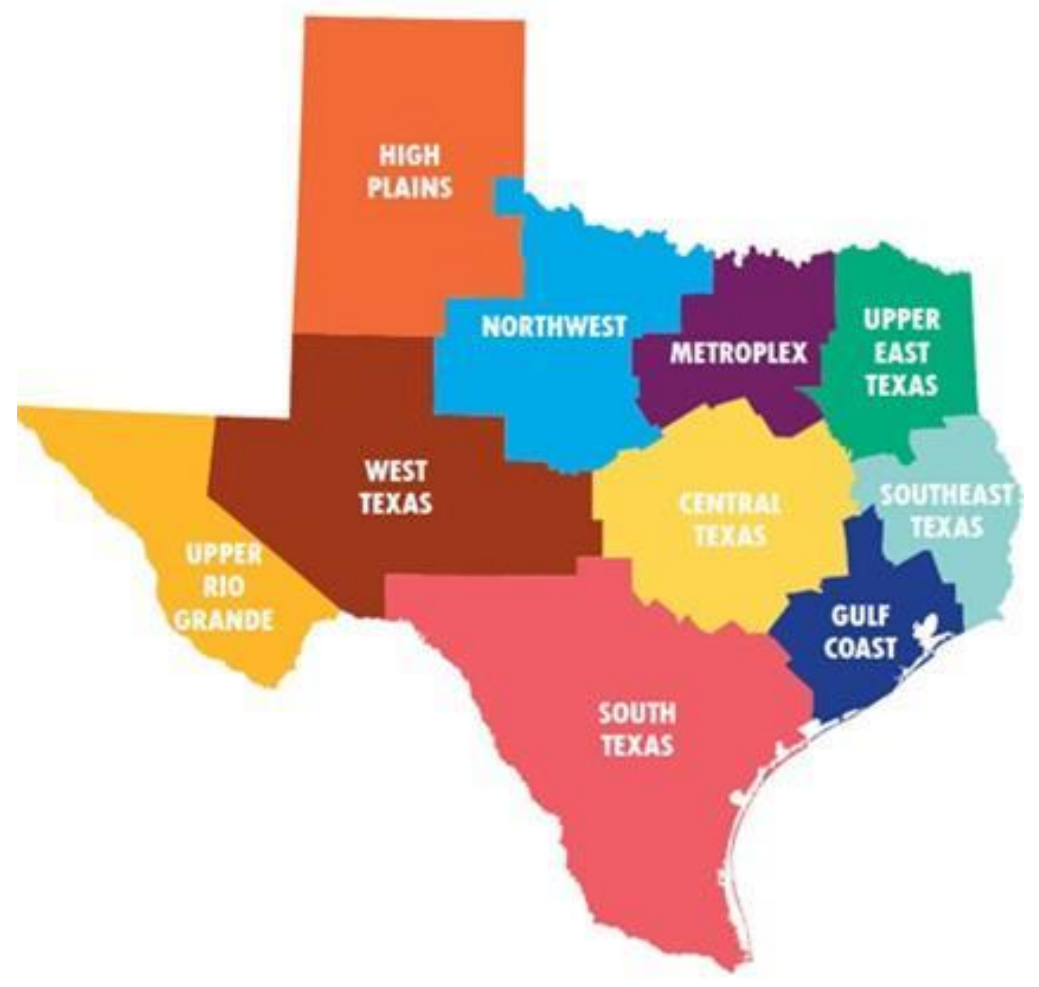
Figure 1. Texas Higher Education Coordinating Board's 10 regions.

white population may be one factor contributing to increases in the predicted future enrollment because of the historical over-representation of this group in higher education. The forecast should not accurately reflect future enrollment if institutions recruit students from different geographic areas or ethnic groups. Institutional decisions to change or impose enrollment limitations would also reduce the forecast's accuracy.